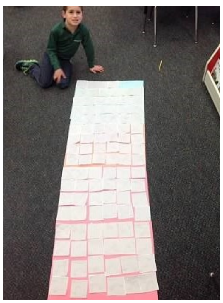
"I did it! I made a Million Chart!"

Stay tuned as we report our ongoing progress on the road to achieving our IB accreditation.